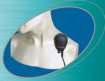
■ CMP750 ▲ CMP950