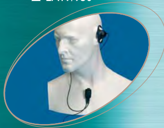
■ EA12/750 ▲ EA12/950