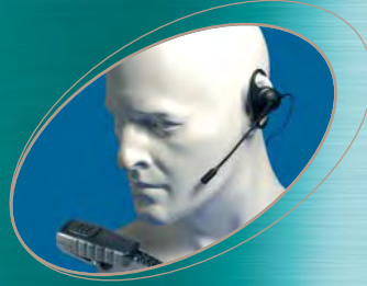
■ EA19/750 ▲ EA19/950