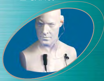
■ EA15/750 ▲ EA15/950